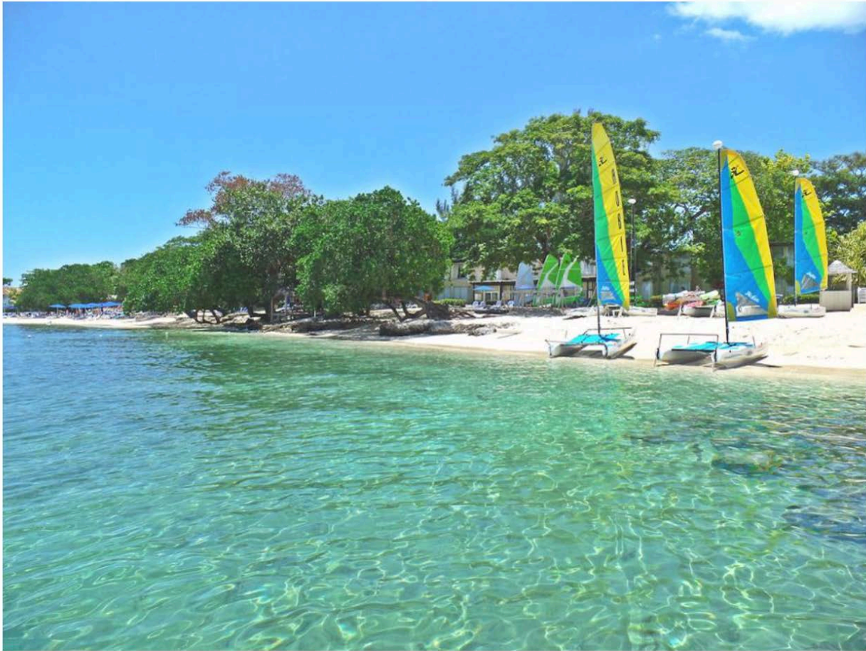
Hedonism II / Negril, Jamaica HEDONISM II

Playlist: Hedo Hustle(r) - Nude Edition or Hedo Hustle(r) - Prude Edition , giving you the option to pursue pleasure your own way but always with an island vibe.