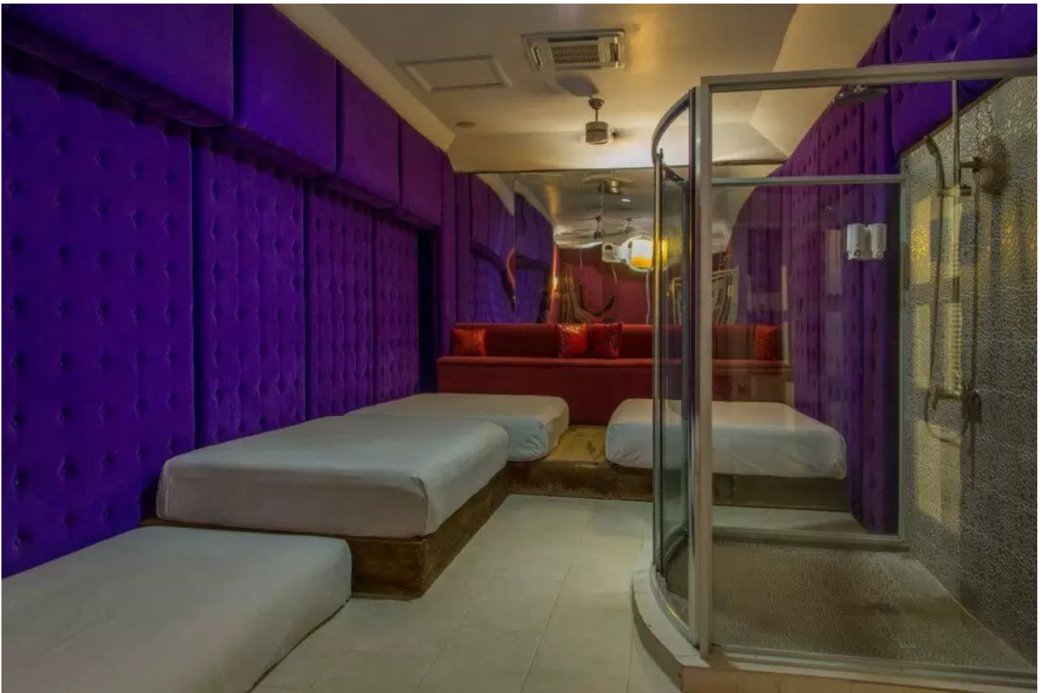
📷 Hedonism II

My partner very accurately said, “I think their motto should be ‘Dip your toe at Hedo.’”