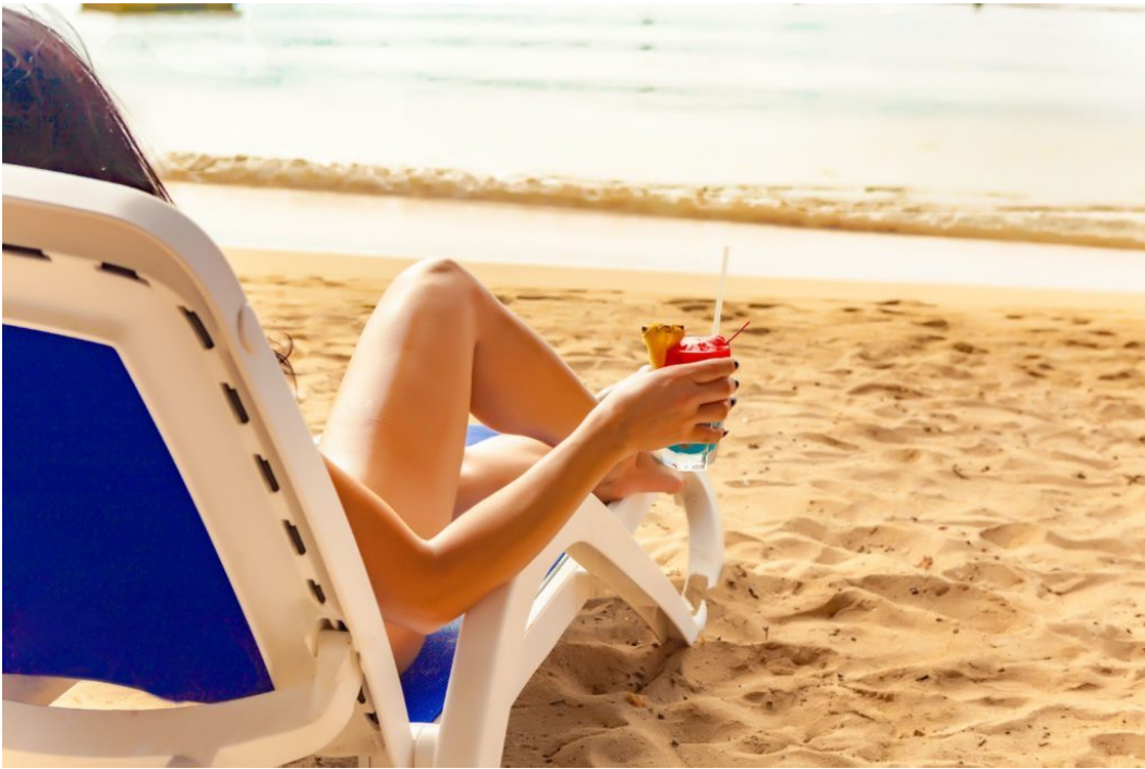
Hedo Girl On Beach With Cocktail