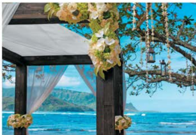
The St. Regis Princeville Resort on Kauai is seen as one of the hottest properties to honeymoon at in Hawaii.