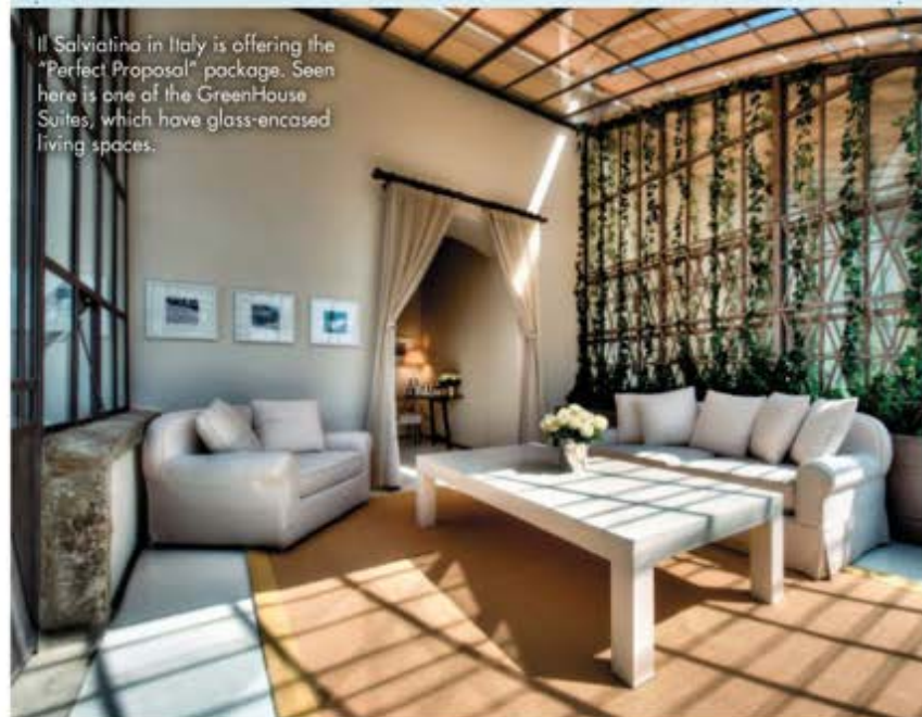
Il Salviatino in Italy is offering the "Perfect Proposal" package. Seen here is one of the Green-House Suites, which have glass-encased living spaces.

A "PERFECT PROPOSAL" IN TUSCANY: Il Salviatino , a restored 15th-century villa located in the Tuscan hills of Italy, is offering the "Perfect Proposal" package, which includes accommodations for two nights in the room of the couple's choice; a daily breakfast buffet; a one-hour couples massage at LA SPA; a romantic, candlelit, three-course dinner; and a three-hour tour with a personal shopper who will escort clients to the best jewelers on the Ponte Vecchio and Via Tornabuoni for the best fashion findings.