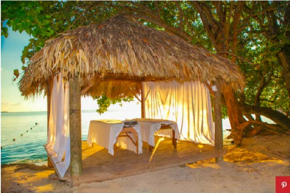
The massage parlor Hedonism II

At dinner, I receive no invites from well-hung couples, but a hostess for the Japanese restaurant on the property automatically seats me with two lesbian couples. I learn that two of the women are sisters, and this is their first family trip. Who kicks off a tradition of sister vacations by going to a sex resort? Even I have my limits.