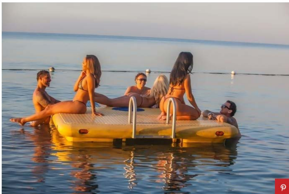
Guests on the beach before disrobing Hedonism II

At the front desk, the receptionist gets me a Red Stripe beer and asks if it's my first time to "Hedo," as everyone calls it. Yep! "So you're a virgin," he says with an eyebrow up. First time to Jamaica? Yes. "A double virgin!" Oh god. So this is where I am.