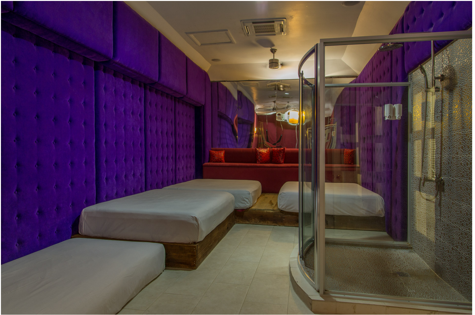
The resplendent interior of the Romping Shop Playroom.

liberating experience that people crave more of once they leave. They return to have uninhibited fun and to feel free.”