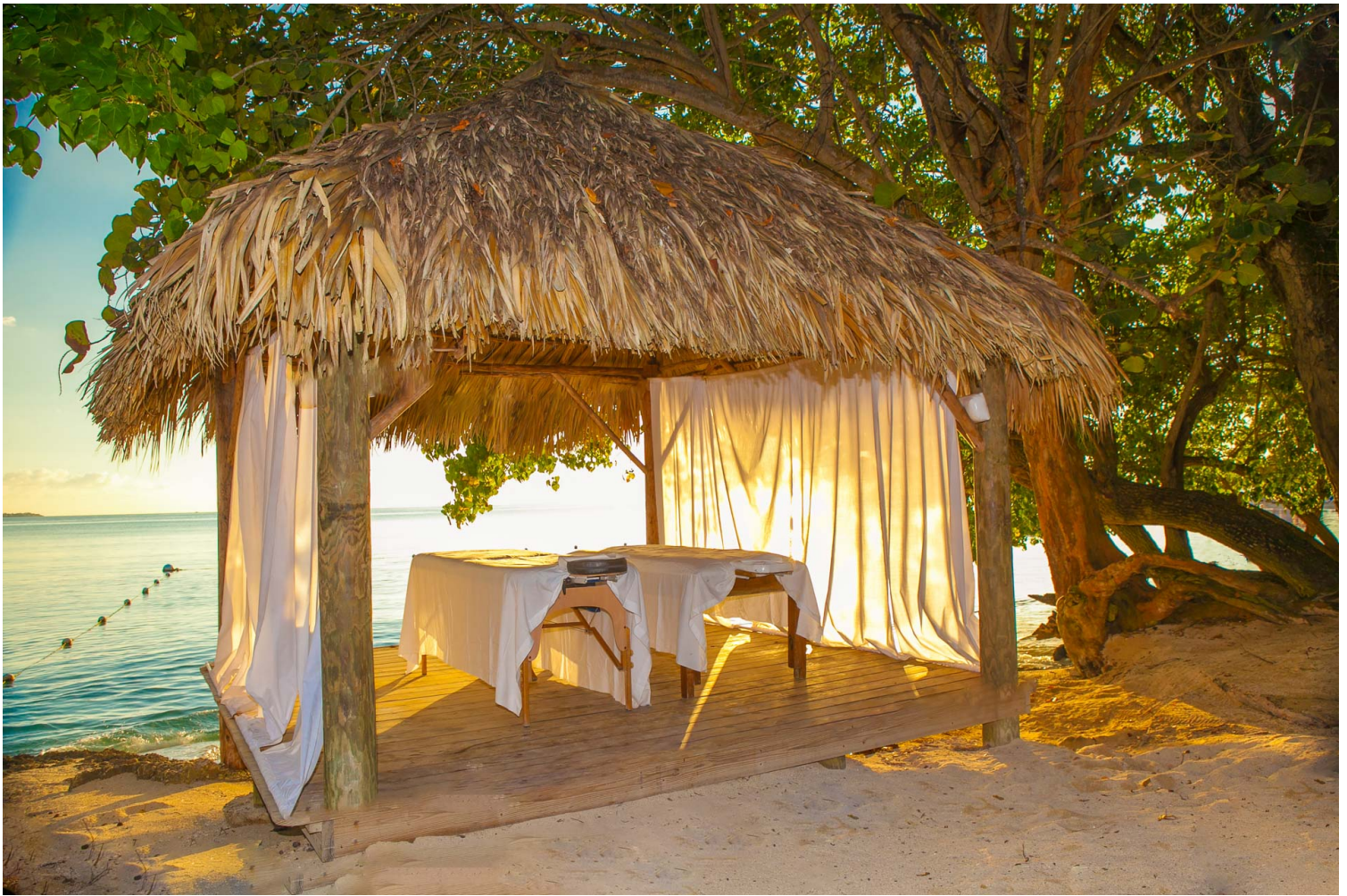
Couples massage tables overlooking the waters of the Caribbean.