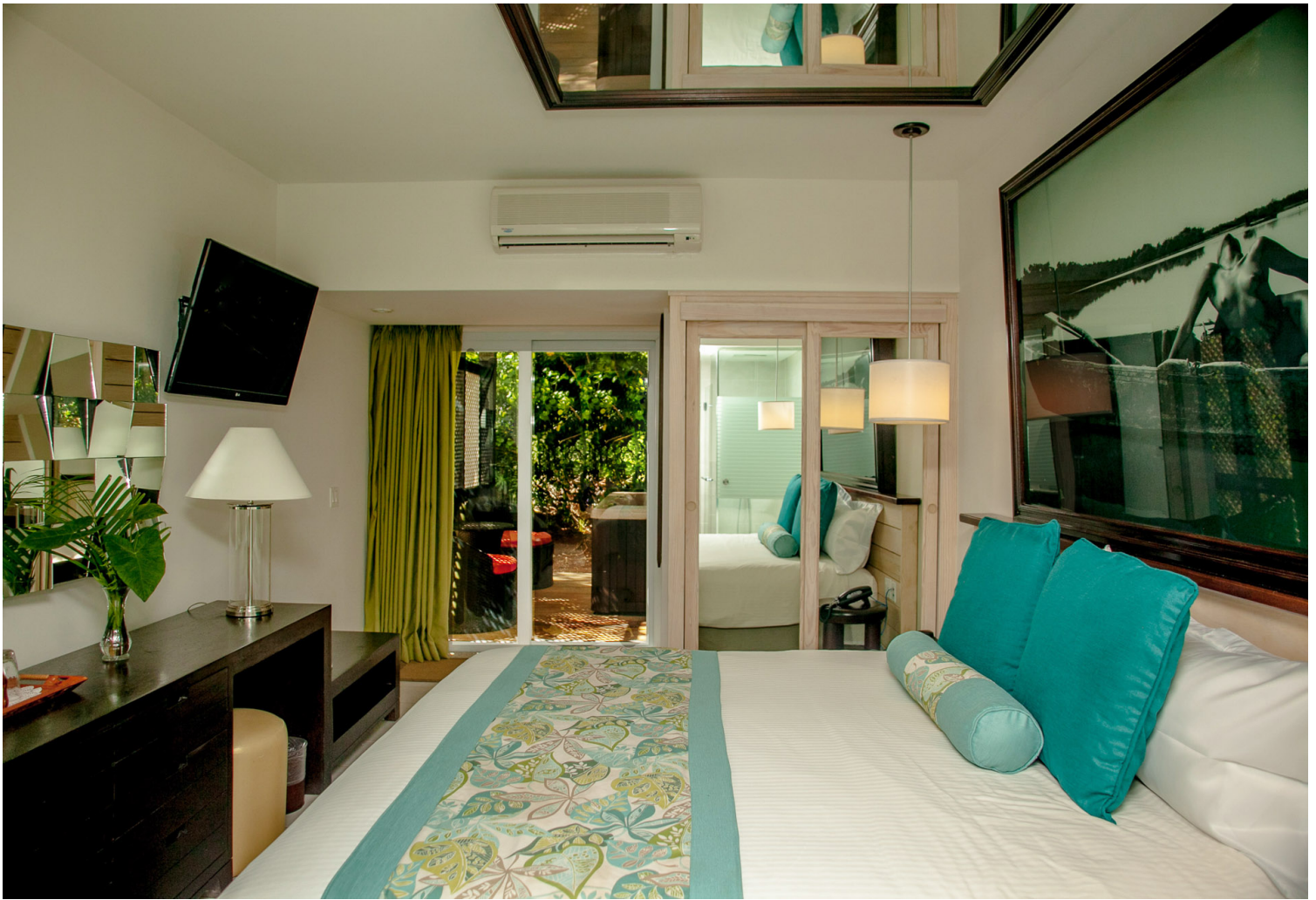
One of the Hedonism II's suites – complete with a mirror on the ceiling.

Sure, some conversations were done in the nude or where guests engaged in sexual acts nearby, but after an hour at the resort, you barely notice. By visiting Hedonism II and experiencing it for yourself, you quickly learn that it's less about the sex or nudity, and more about the good energy, and how it allows you to tap into the sexual and empowered person that you are.